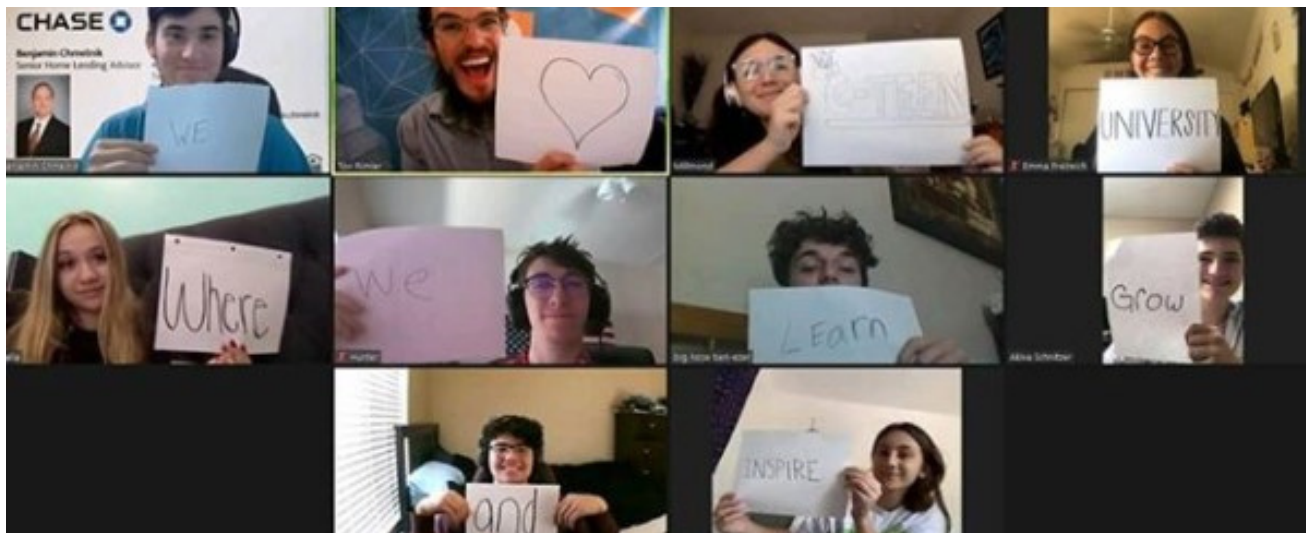
The nine teens that participated in the CTeen University Summer Course.